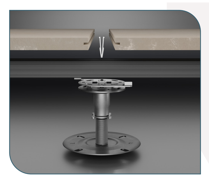
Venice Clip Push—this item serves as a universal solution for all porcelain within the RAAFT® collection.

During installation, especially in wind uplift scenarios, our design incorporates a clip securely inserted into the groove. This not only ensures a snug fit but also acts as a protective 'buffer' between tiles, facilitating removal and reinstallation without compromising structural integrity.